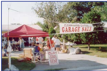
Civitan Garage Sales

Civitan is dedicated to improving their communities through helping others. The major International project is the Civitan International Research Center at the University of Alabama at Birmingham, leading in research and treatment for mental handicaps and a wide range of other developmental disabilities. Locally, Clearwater Civitans have been involved in the community with the service activities listed below.